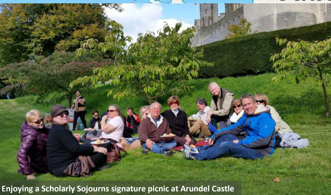
Enjoying a Scholarly Sojourns signature picnic at Arundel Castle

Rain is likely at this time of year. Participants are encouraged to bring a lightweight, waterproof jacket or a small umbrella. The humidity levels vary greatly depending upon location. Inland is hotter and drier, while the coastal climate is slightly cooler and more humid.